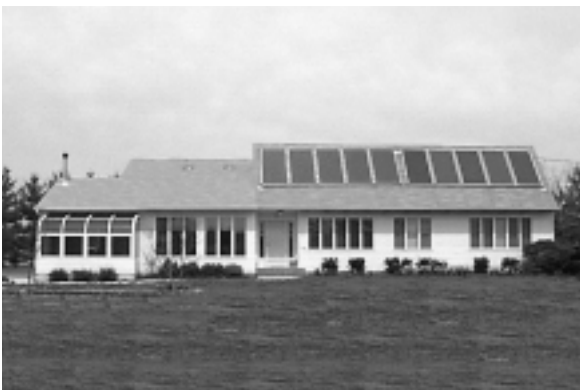
Ten flat-plate solar collectors heat water for this home in Elm, New Jersey; its many south-facing windows reduce heating bills in winter.

3. Title I Property Improvement Mortgage Insurance — Title I insurance enables lenders to make property improvement loans to creditworthy borrowers with little or no equity in their homes. For single family-homes, the maximum loan is $25,000. These second mortgages do not require energy efficiency calculations. Borrowers can piggyback Title I on Title II loans to help finance solar improvements that otherwise would not be eligible under the first mortgage.