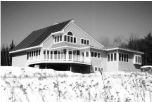
PIX04470/COURTESY OF SOLAR DESIGN ASSOCIATES, INC.

A house on the coast of Maine beautifully integrates a utility-grid-tied photovoltaic power system into the roof.